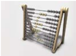
Ensure correct billing, for you and your customers

Today, manual tests not only provide inaccurate, untrustworthy but in most cases cost inefficient testing. To ensure correct billing, a precise and reliable Revenue Assurance system is essential. With a SITE test system, continuous testing of all services provides maximum assurance that all calls are being correctly billed as each network element can be tested and verified.