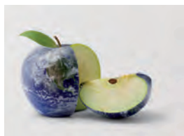
Inside out – core network testing can save money

Another instance where connection direct to core network components is required is where tests need to be executed in a very short time. This is typically the case when network components like the MSC or SGSN have been updated or where the influence of a high number of concurrently connected subscribers has to be checked immediately and automatically. Such kinds of regression testing can usually be executed in less than 20 minutes whilst still covering all services and subscriber profiles.